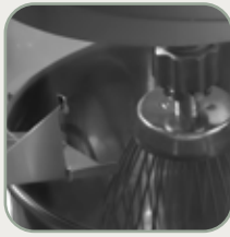
Bowl guard of transparent AR plastic and conveyor for liquid addition.

Riparo vasca in plastica trasparente AR e convogliatore liquidi.