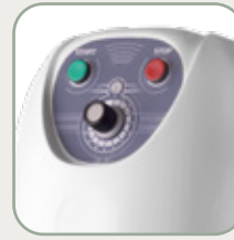
Control panel for SMART 40-30FV.

Pannello di controllo per SMART 40-30FV.