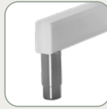
Adjustable feet of inox steel.

Leva per salita/discesa vasca in SMART 40-60-80 LVS.