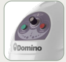
Control panel for SMART 40-60-80 LVS.

Pannello di controllo per SMART 40-30FV.