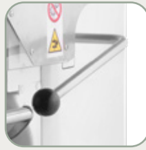
Lever for Bowl lifting/lowering for SMART 40-60-80 LVS.

Riparo vasca in plastica trasparente AR e convogliatore liquidi.